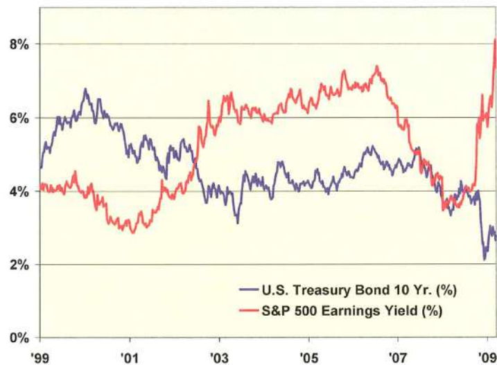
U.S. Treasury 10-year Note Yield vs. S&P 500 Earnings Yield

In recent days, investors seem to be moving from a depression mentality to a recession mindset. A sign of this is the VIX (CBOE volatility indicator), which dropped from a high of 89 to 36 – its lowest level since September 2008 when the Panic started. There are still many challenges which the economy and the market must overcome, not the least of which are the dismal 1st quarter corporate earnings and GDP numbers soon to be reported. Investors also fear the potential damage Washington can do to the economy and the stock market. On balance, however, the low valuations of quality stocks still discount a Depression scenario. The chart below shows the relationship between the earnings power of stocks compared to that of bonds over the past decade and demonstrates the current attractiveness of stocks compared with the 10-year U.S. Treasury note (the earnings yield of the S&P 500 Index is the reciprocal of the P/E ratio – recently at 12.5):