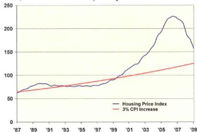
S&P/Case-Shiller 10-City Composite Home Price Index

We believe that investors need two positive signs before they are fully ready to move their cash from the sidelines back into the stock market. The first is a clear indication that housing prices are bottoming out. This could well happen by the end of 2009, as the chart below shows: